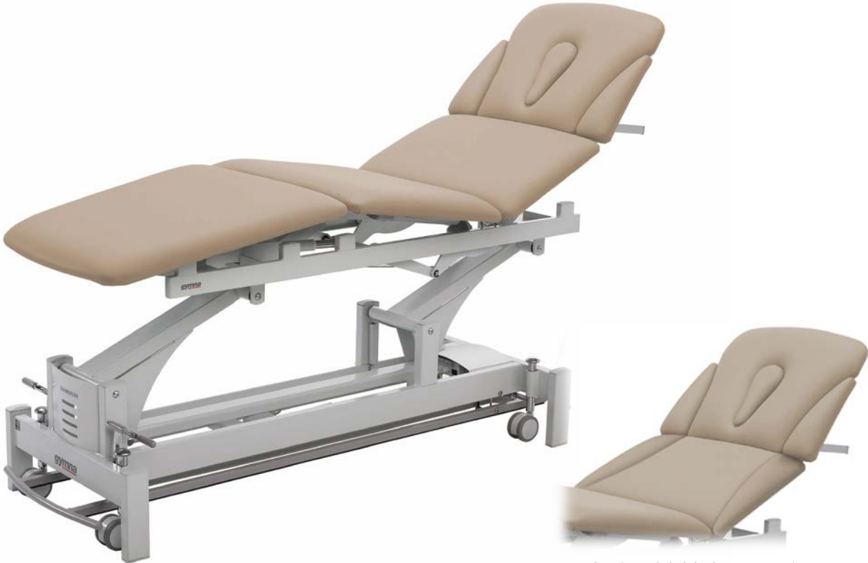
Optional fold-down sections